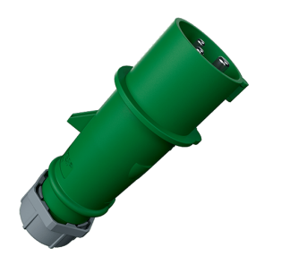
Part no. 2271